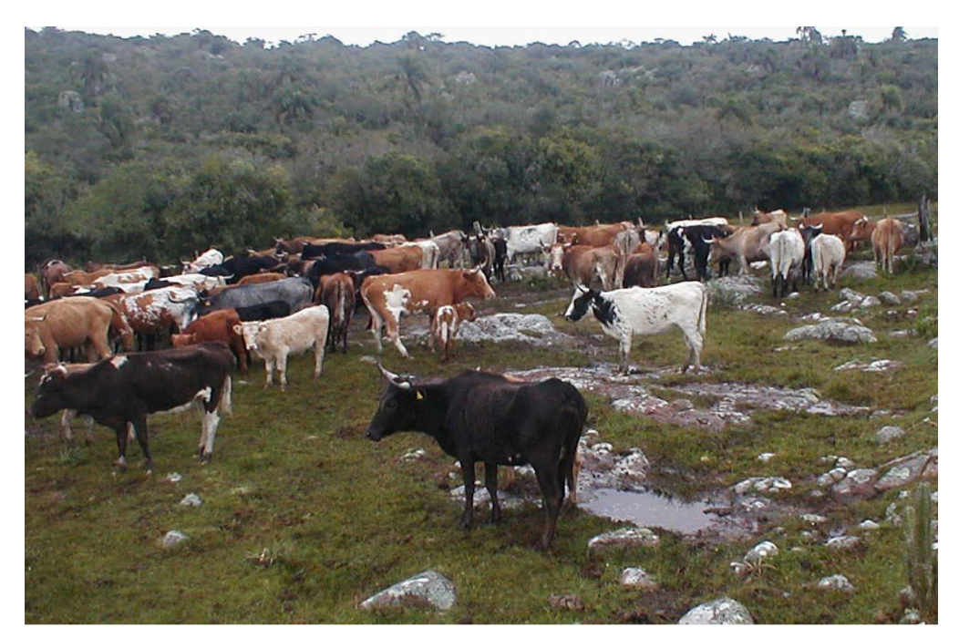
Figure 1. Picture of the Uruguayan Creole cattle herd at San Miguel National Park, Rocha, Uruguay.

Genomic DNA was extracted from random blood samples of 64 Uruguayan Creole cattle (Figure 1). The 17 dinucleotide microsatellite loci studied are all included in the list proposed by FAO (1999; Initiative for Domestic Animal Diversity) and/or in the databank of the bovine diversity project "Cattle Diversity Data Base" (www.fao.org/dad-is; www.thearkdb. org).